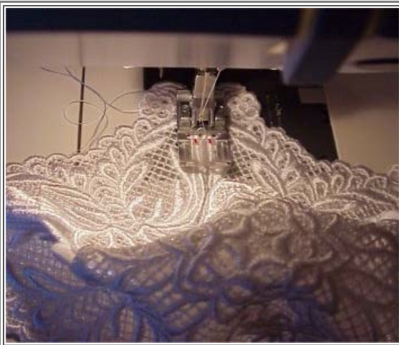
Sewing the last seam from the top

the 4 sided basket has a saucer like Lip.. sew as shown.. Use a loose zig zag as you will want