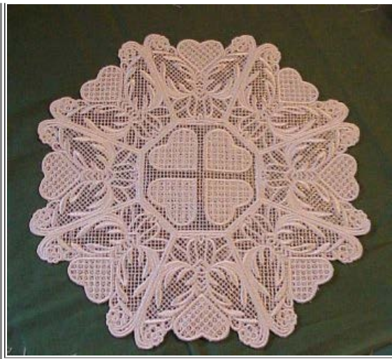
Close up of the pattern on the Doily